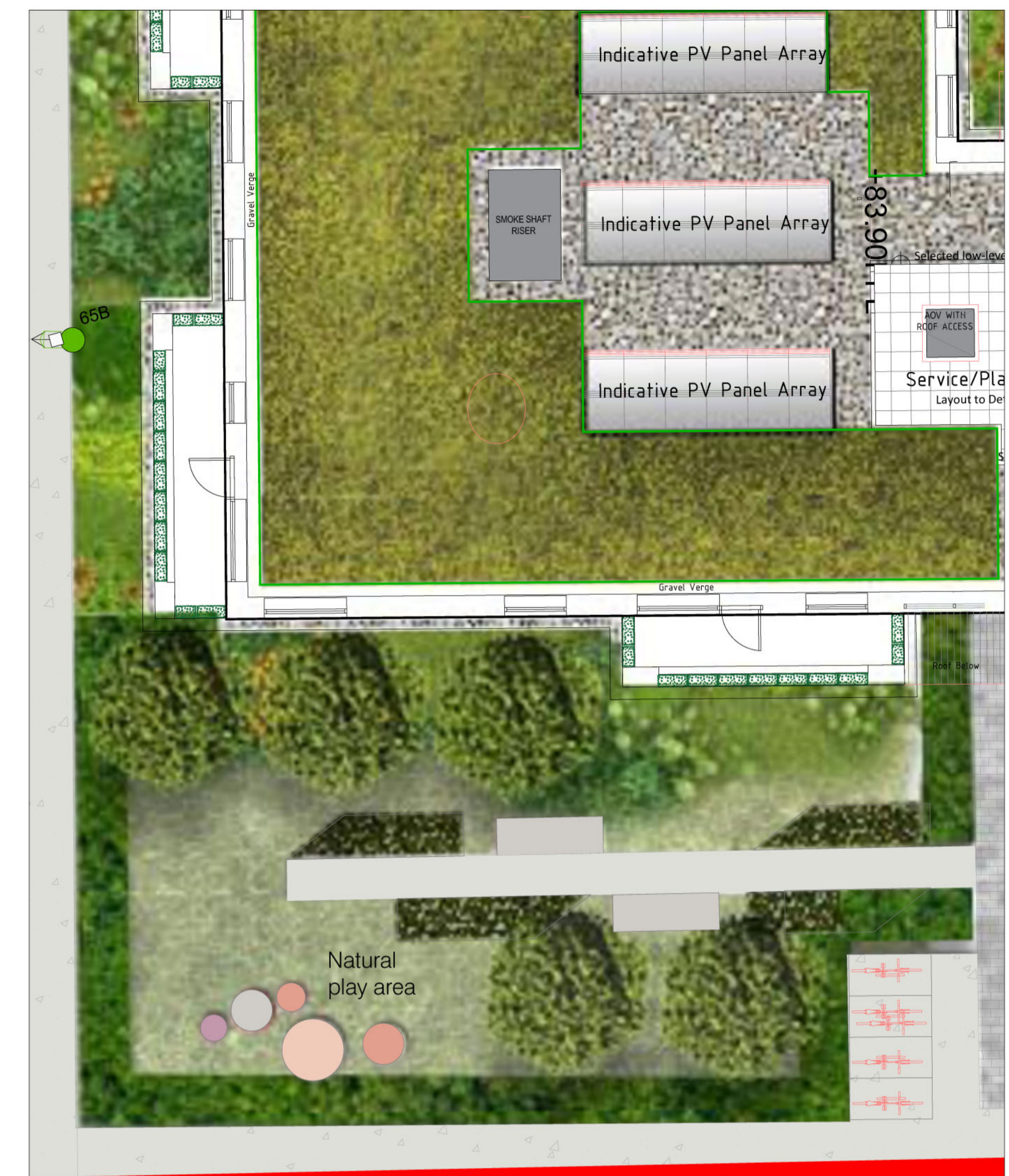
PRIVATE AMENITY AREA - BLOCK F - 240SQM