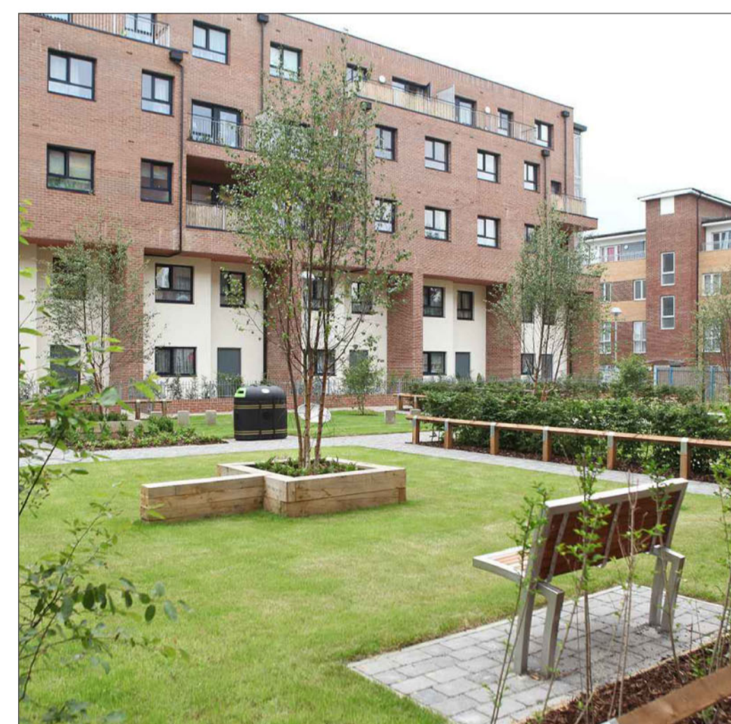
PRIVATE AMENITY AREA - SEATING AREA