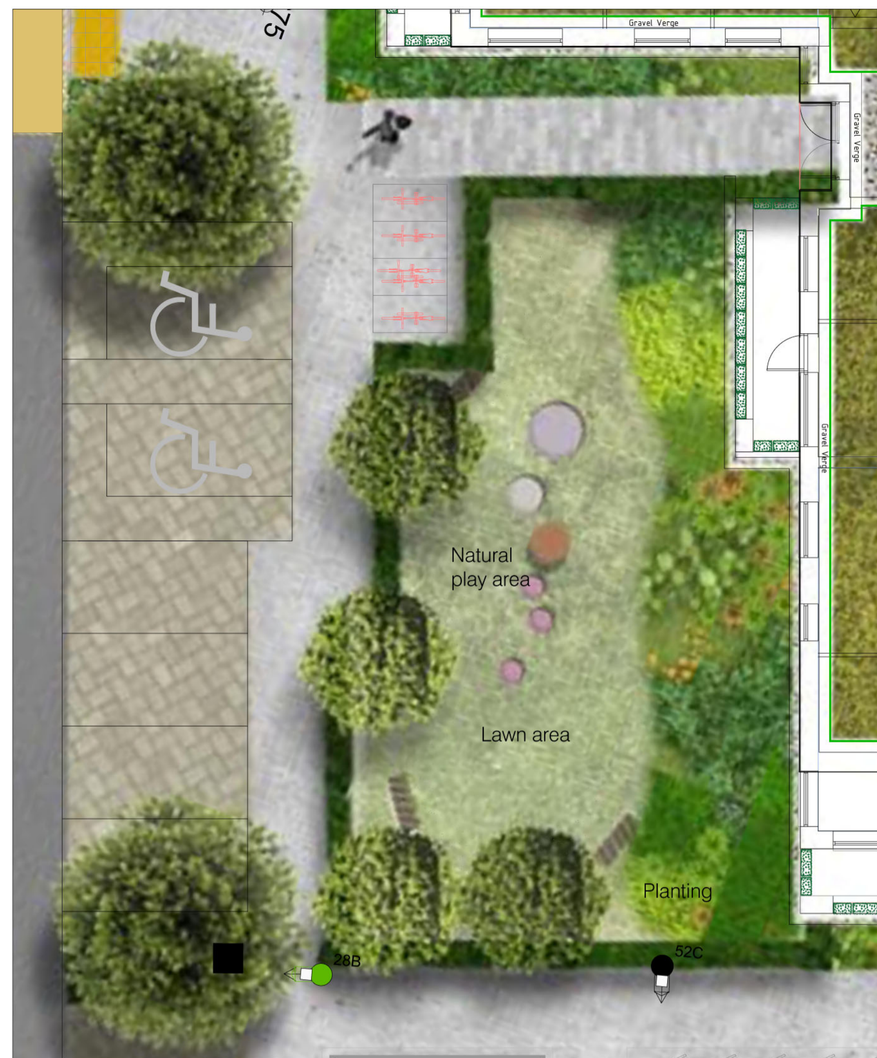
PRIVATE AMENITY AREA BLOCK E - 240SQM