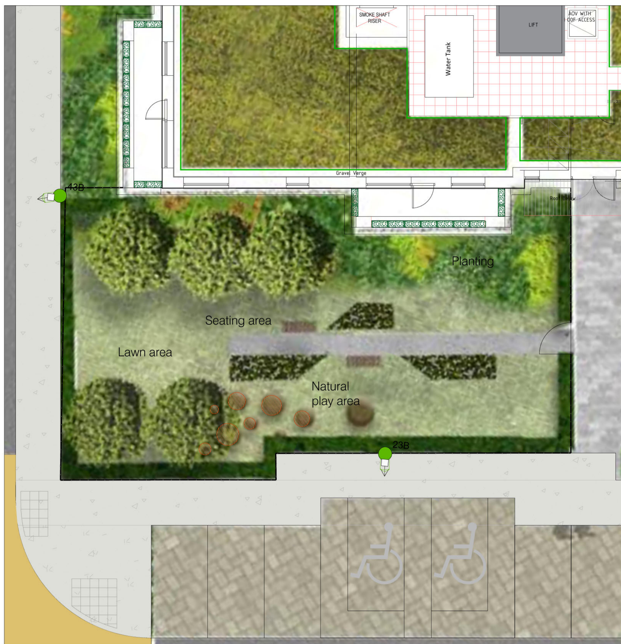
PRIVATE AMENITY AREA BLOCK D - 220SQM