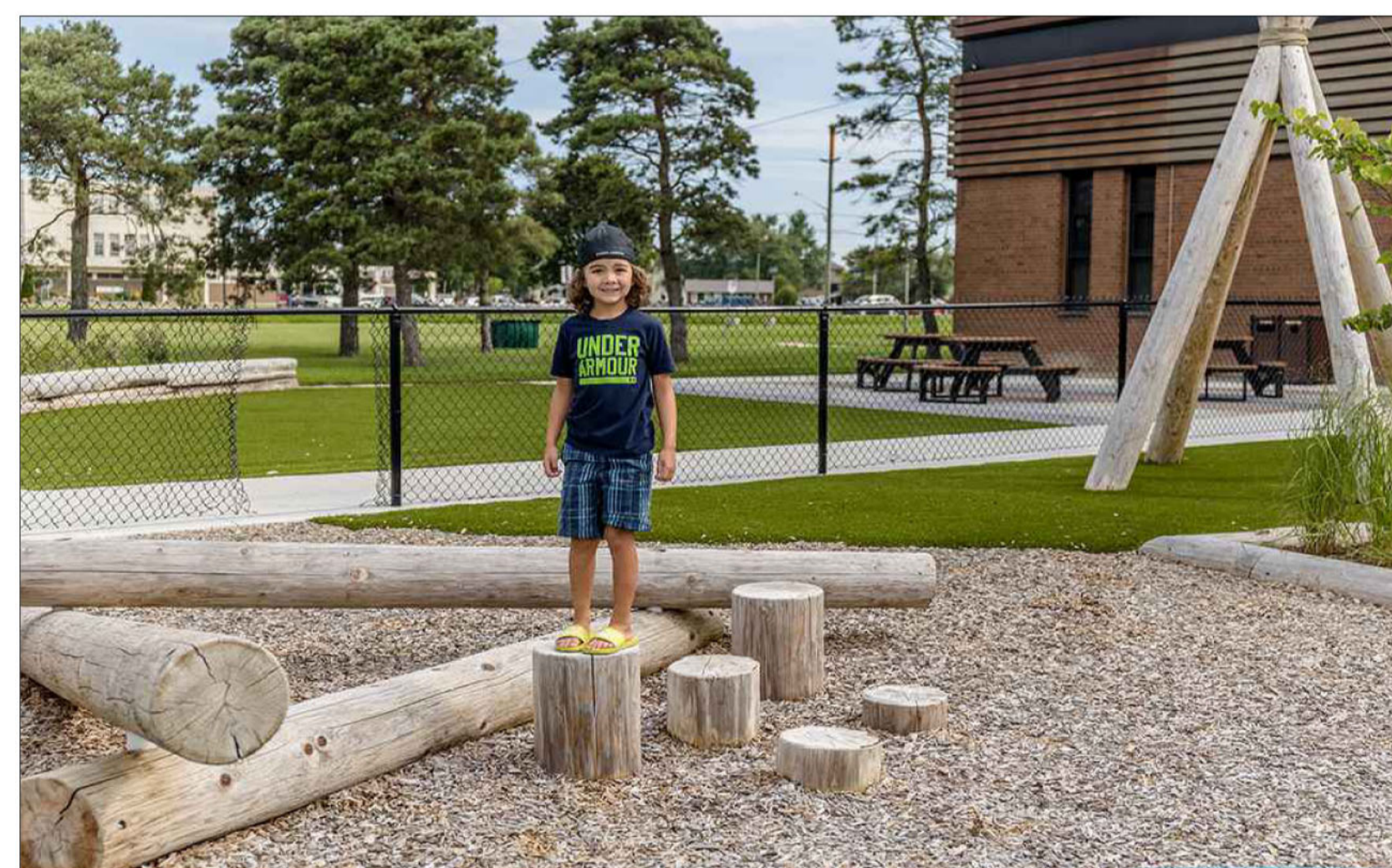
NATURAL PLAY ELEMENTS