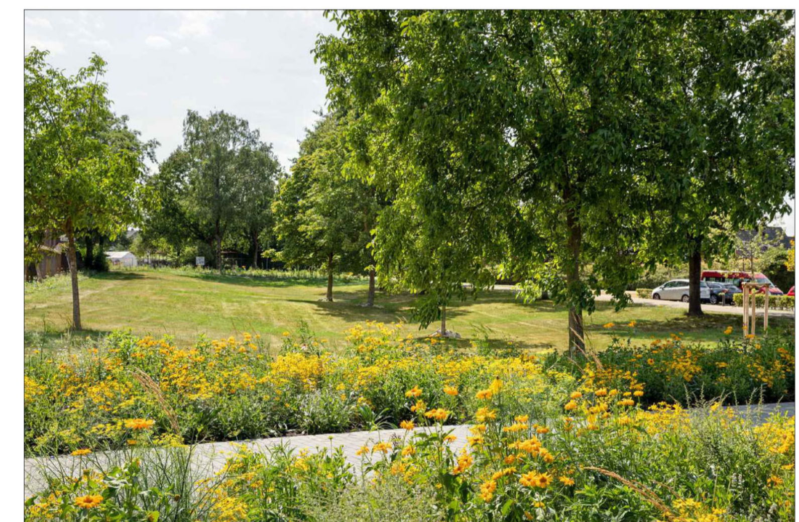
LAWN AREAS AND PLANTING